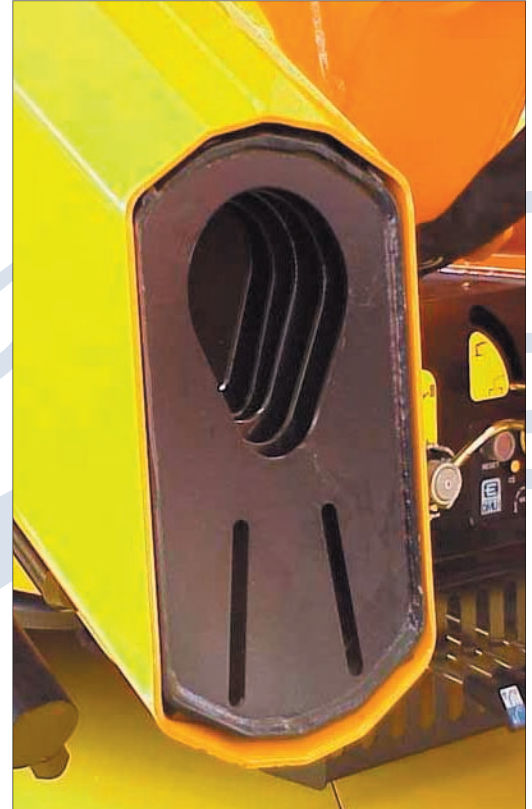
Incremento Peso/Prestazioni derivante dal Profilo Decagonale SRII Weight/Performances Gain due to the Decagonal Boom Profile Gain en Poids/Performances apporté par les Bras de Profil Decagonal